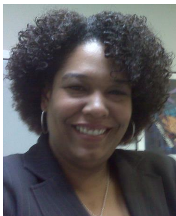
IICS Advisory Board