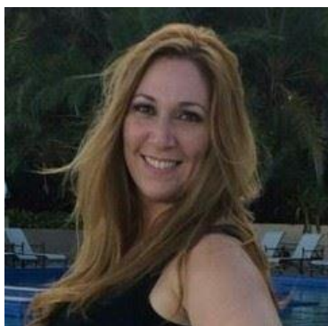
IICS Dean of Students IICS Advisory Board