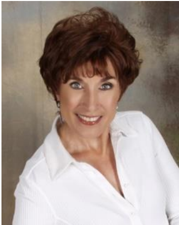
IICS Advisory Board