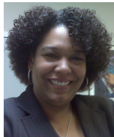
IICS Advisory Board