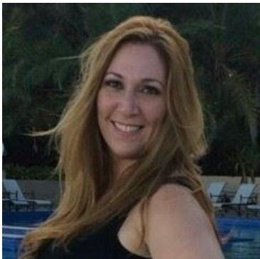
IICS Dean of Students IICS Advisory Board