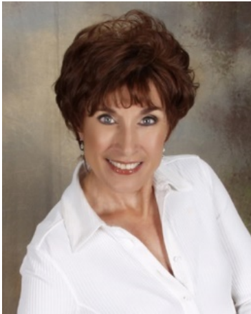
IICS Advisory Board