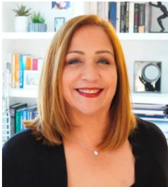
Sexuality and Disabilities Instructor