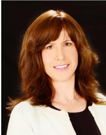
IRB Committee Chair IICS Advisory Board Research Chair