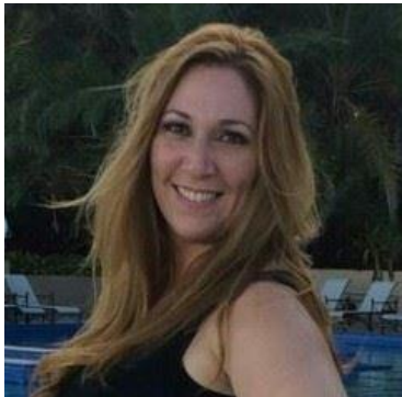
IICS Dean of Students IICS Advisory Board