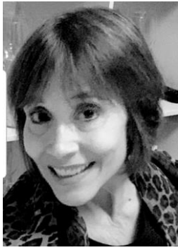
Sexuality and Disabilities Instructor