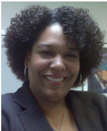
IICS Compliance Officer IICS Advisory Board