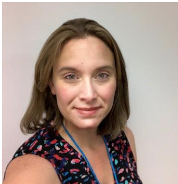
Sex Offender Therapy Instructor