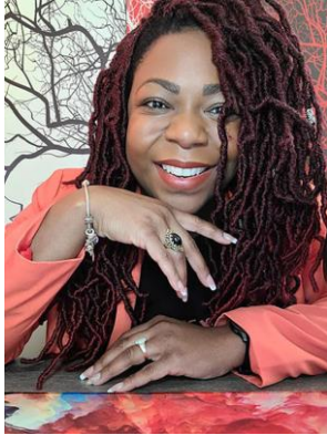
Kink Conscious Therapy Instructor Director of New Student Engagement.