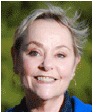
Sexuality and Disabilities Instructor