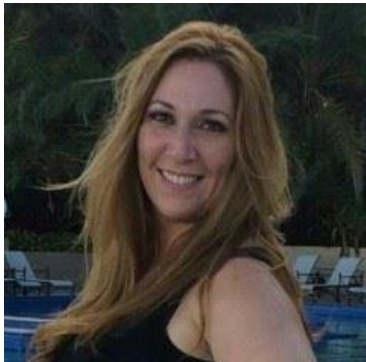
IICS Dean of Students IICS Advisory Board