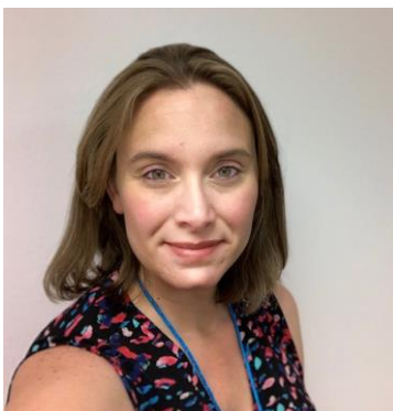
Sex Offender Therapy Instructor