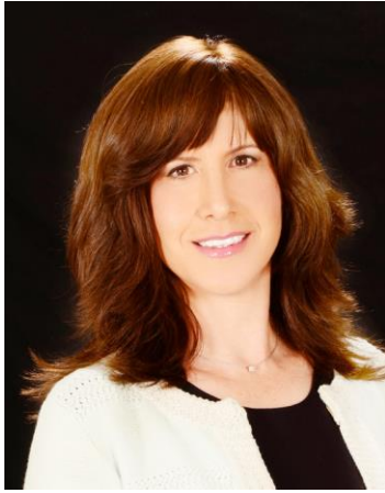
IRB Committee Chair IICS Advisory Board Research Chair