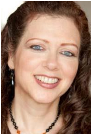
Kink Conscious Therapy Instructor