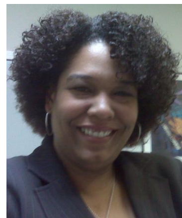
IICS Compliance Officer IICS Advisory Board