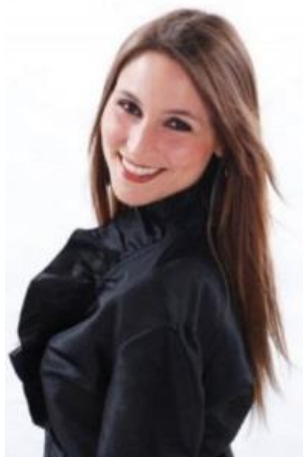
IICS Advisory Board