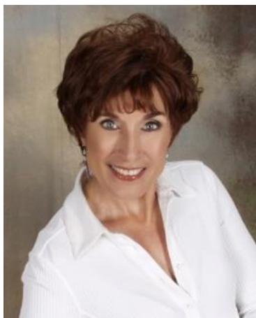
IICS Advisory Board