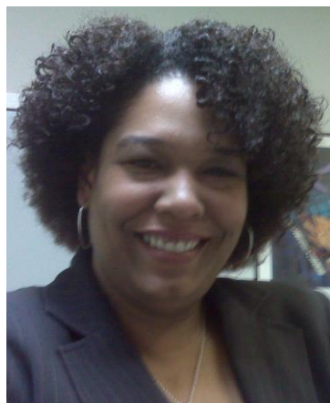
IICS Advisory Board