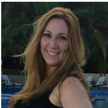
IICS Dean of Students IICS Advisory Board