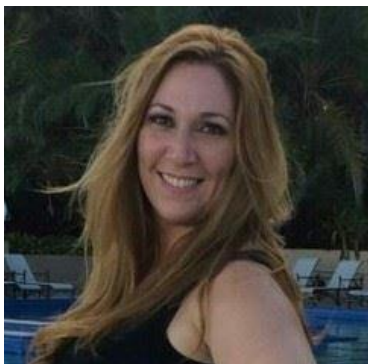
IICS Dean of Students IICS Advisory Board