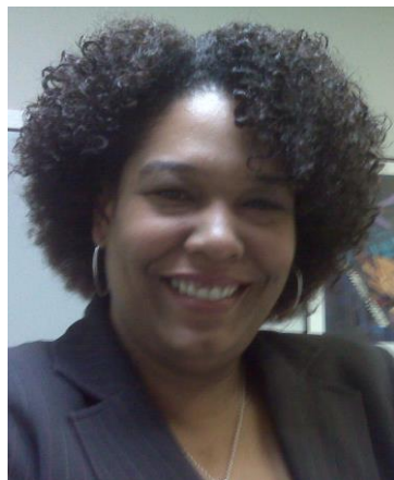
IICS Compliance Officer IICS Advisory Board