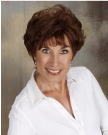
IICS Advisory Board